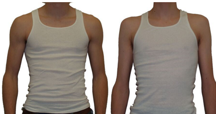
Figure 2. Example of strong (left) and weak targets

Social Targets. Following the priming procedure, participants evaluated eight men who were ostensibly fathers living in the previously presented community. Men in these pictures were physically strong or weak, which was previously determined by composite measures of their grip strength and chest press that serve as a reliable proxy for upper body strength (Lukaszewski et al., 2016). Previous research indicates that participants are accurate in identifying these targets' strength across categories, which we continued to assess using a single-item measure assessing perceived target strong (1 = Not at All Strong ; 7 = Very Strong ). Images were of eight unique White men photographed from the waist up in standardized white tank tops. We framed their appearance as being standardized to minimize the influence of potential stereotypes of these shirts as “wifebeaters” among low-income communities. Figure 2 provides example bodies.