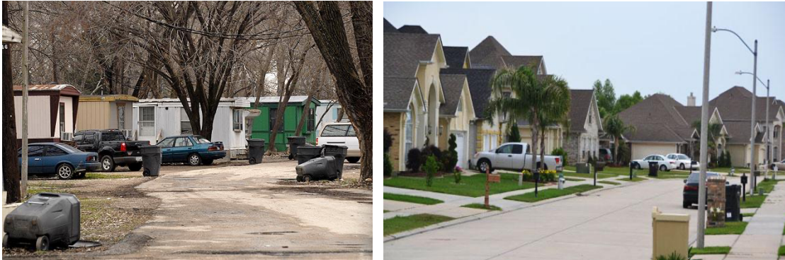
Figure 1. Images for the desperate (left) and hopeful ecologies

Social Targets. Following the priming procedure, participants evaluated eight men who were ostensibly fathers living in the previously presented community. Men in these pictures were physically strong or weak, which was previously determined by composite measures of their grip strength and chest press that serve as a reliable proxy for upper body strength (Lukaszewski et al., 2016). Previous research indicates that participants are accurate in identifying these targets' strength across categories, which we continued to assess using a single-item measure assessing perceived target strong (1 = Not at All Strong ; 7 = Very Strong ). Images were of eight unique White men photographed from the waist up in standardized white tank tops. We framed their appearance as being standardized to minimize the influence of potential stereotypes of these shirts as “wifebeaters” among low-income communities. Figure 2 provides example bodies.